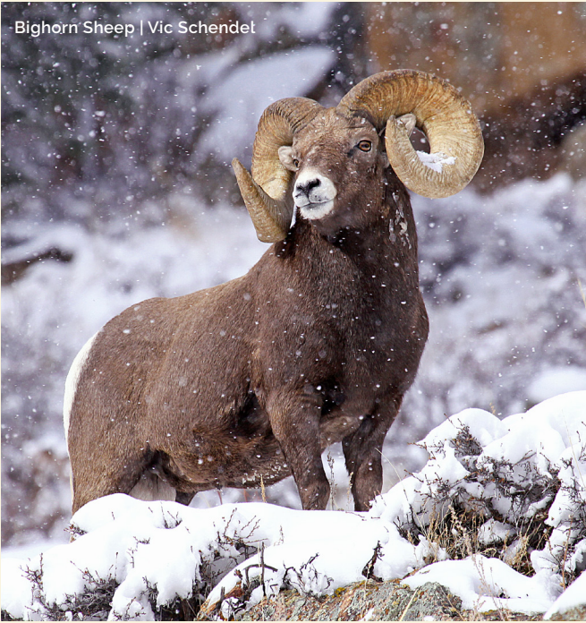
Bighorn Sheep | Vic Schendel